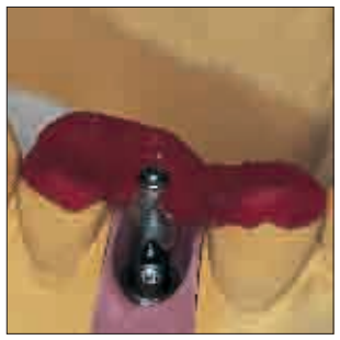
1. Undo the basal screw with the SCS screwdriver and remove the index from the master cast.

After fabrication, the restoration is given to the dentist on the master cast together with the abutments.