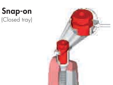
2. The octagon of the synOcta® Positioning cylinder must be aligned with the octagon of the implant and inserted into the impression cap up to the limit stop.