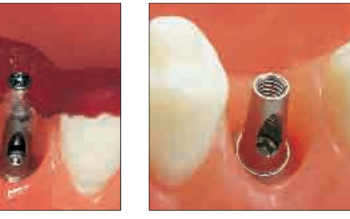
3. Undo the occlusal screw and remove the index. Then cement or screw in the restoration.

Note: If the restoration is cemented, the lateral and occlusal opening must be sealed off with gutta-percha.